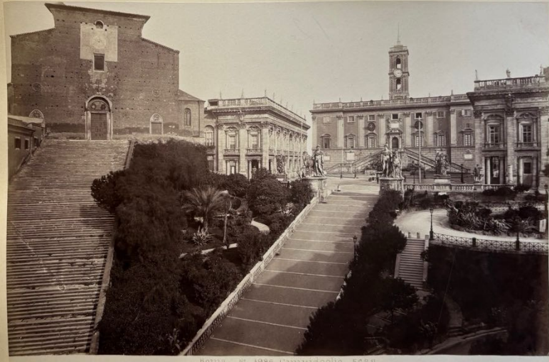
Roma n° 3986 Campidoglio 5029.