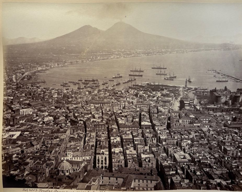
Des 1803, Naples. Vue prise de la Chartreuse S. Martin.