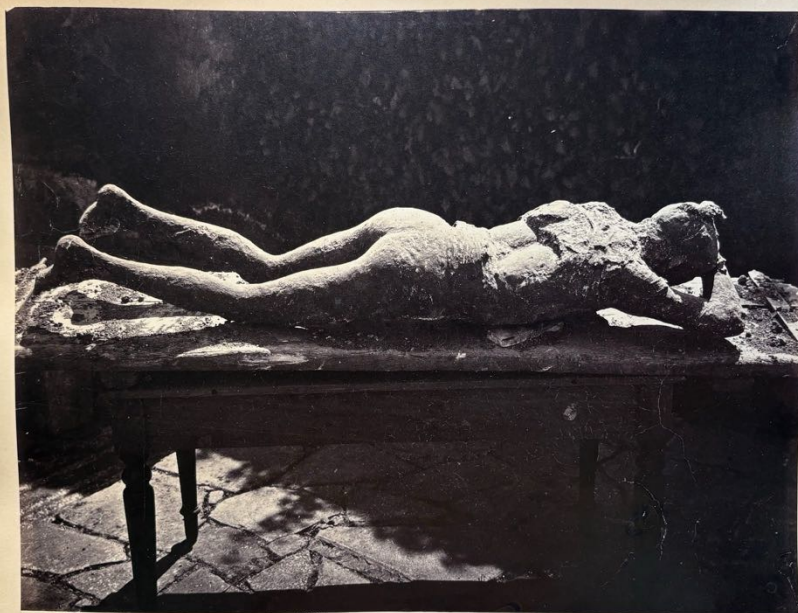
Bompei jeune femme couchée 1828