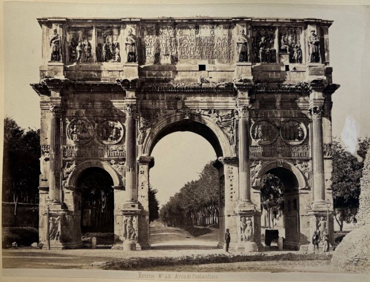
Roma N. 43 Arch di Costantino