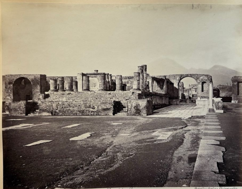
70. 4241. Pompei. Temple Jupiter (forum publique) fouilles

Amedeo Castelli Photographie Naples Rue Vittoria 207 2/2.