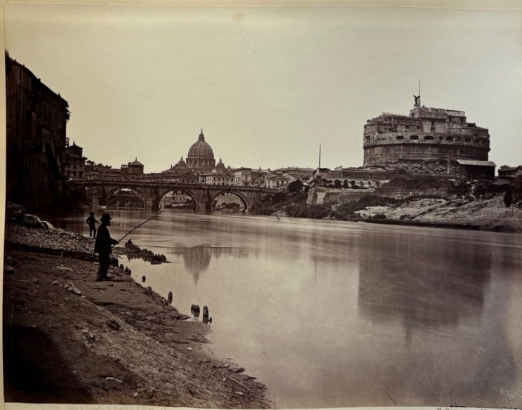
G. Sommer - Napoli