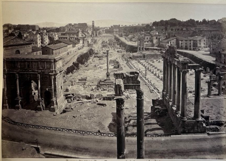
Roma N. 5509 Foro Romano dal Campidoglio