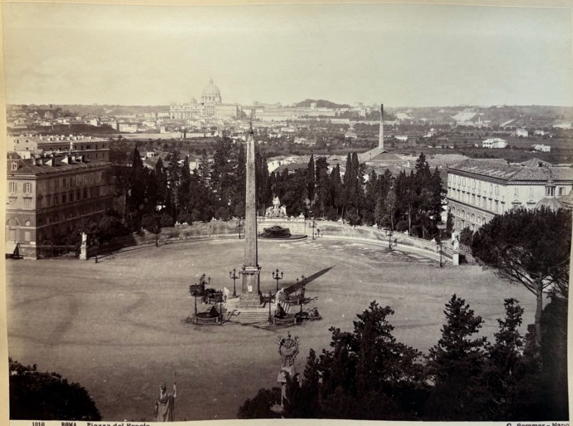
1910 ROMA. Piazza del Popolo