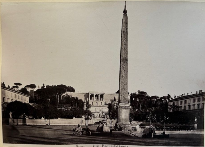
Roma - n° 20 Piazza del Popolo