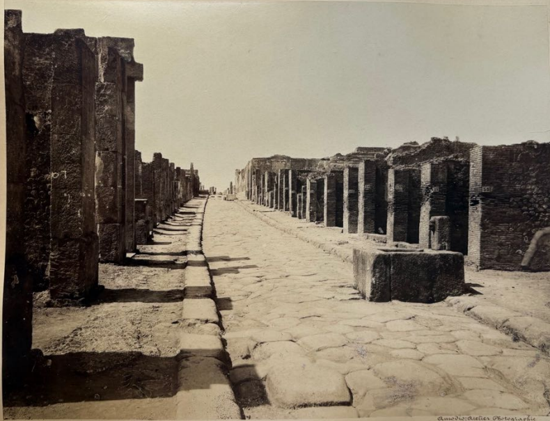
70. 4211. Pompei. Rue Abondance.

Amedeo Castelli Photographie Naples Rue Vittoria 207 2/2.