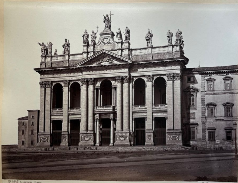
N° 1016. S. Giovanni. Roma.