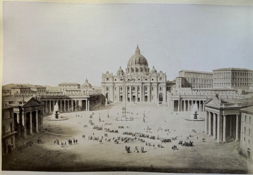
Roma n. 2004 S. Pietro - Fontana in carrozza col corteggio