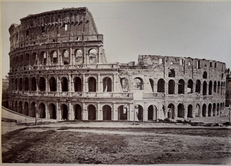
Roma n. 325 Colosseo