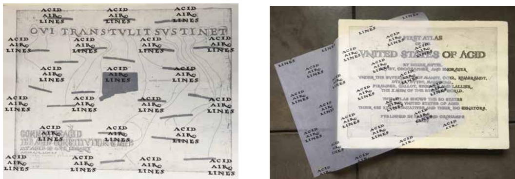
The plates are interleaved with custom printed guard sheets