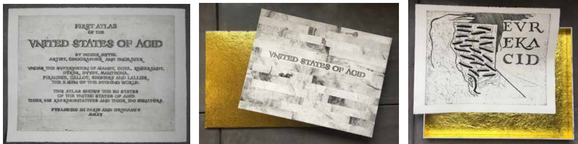
Title page, custom box, and the plate for Northern California